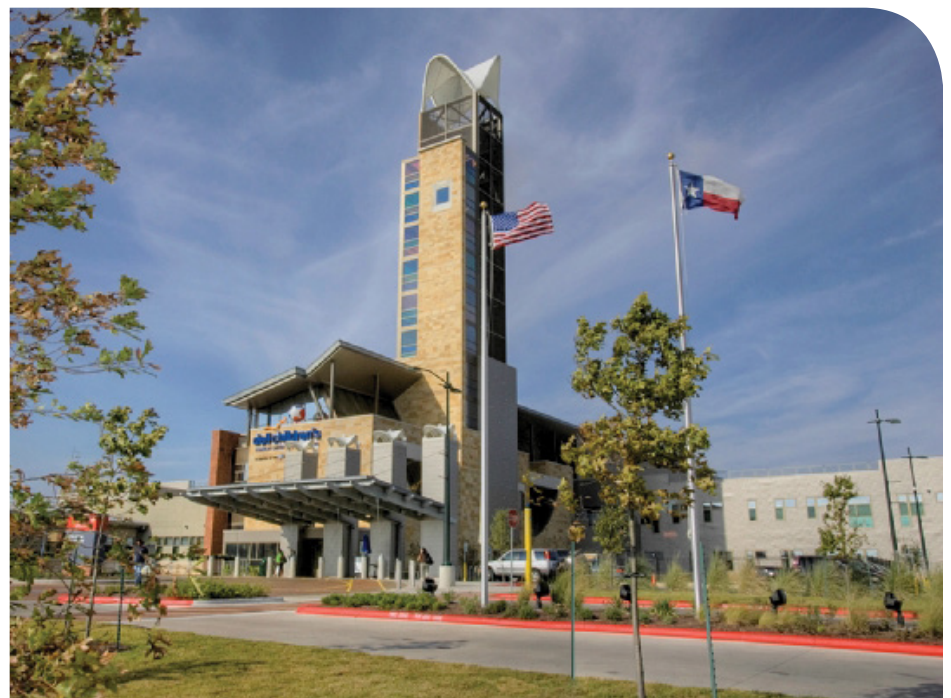
Dell Children's Medical Center